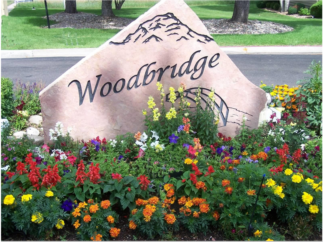
(Sam Giamarvo's picture)